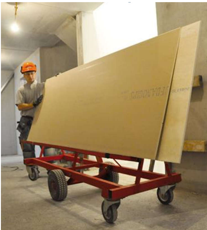
Loaded Trolley Being Moved

The movement of large sheet materials has been a real concern on some sites, with their unwieldy shape and size catching out numerous tradesmen and site operatives, who have suffered unnecessarily due to poor manual handling and double handling. This kind of board trolley eliminates a lot of the double handling, as sheet materials are loaded in a vertical plane and manoeuvred throughout the site. Once in the desired location, the press of a pedal puts the brakes on, and allows the trolley to tilt, converting it into a convenient work bench.