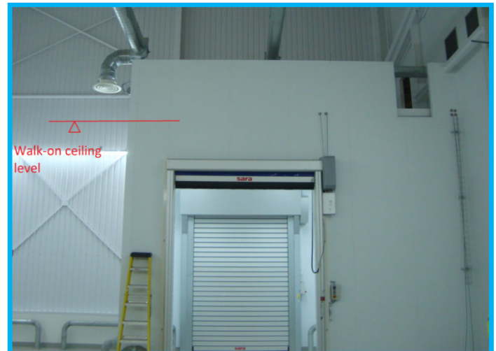
View From Ground