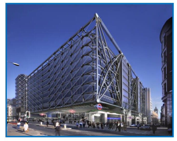
Cannon Place Bridge Structure

Graphic presentation of the proposed sequence for contractors to understand the structural and constructional design intentions.