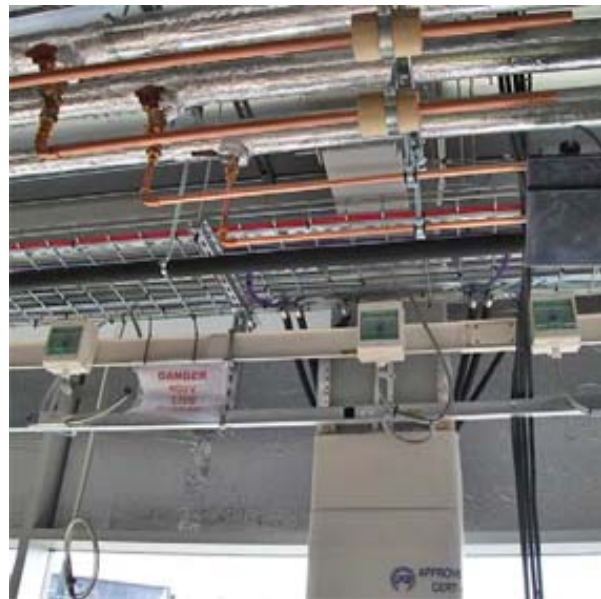
Bus Bar shown in ceiling void