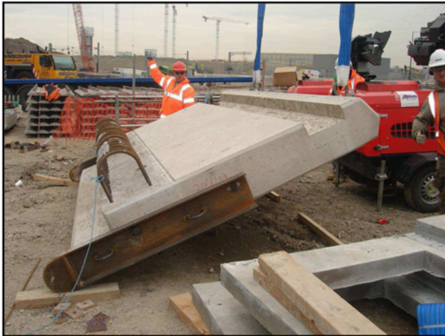
Temporary Turning Plates fitted to Precast Panel

This technique can be replicated to suit a variety of different shapes and sizes of precast units.