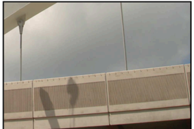
Finished Panels Erected