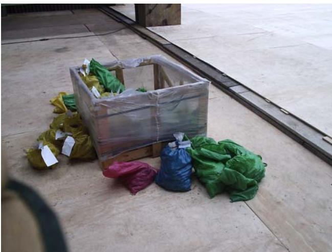
Colour Coded Bolt Bags