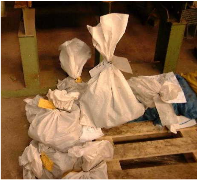
A Typical Pile of Bolts

Peers use standardized bolts in erection. To further assist the erectors we now deliver these bolts in colour coded bags which instantly identifies their size.