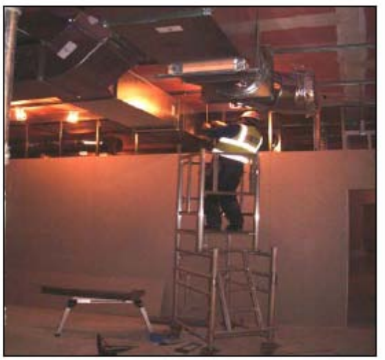
Aircraft Type Access Equipment